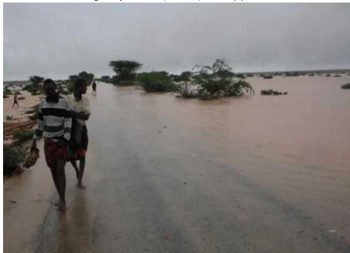
Flooding on the road between Burtinle and Galkayo

<click here for the DREF budget; here for contact details; here to view the map of the affected area>