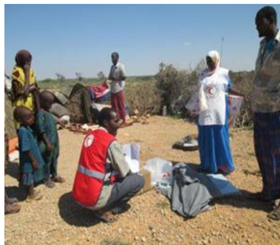
SRCS Staff and volunteer distributing NFIs to nomadic settlements affected by the cyclone in Uusgure village, Dangorayo District, Nugaal region.

The State of Puntland held its presidential elections on 8 January 2014 which went on peacefully, however tension before the election day affected the relief operations, when movement had to be more restricted. Currently the situation has normalised and the activities under the operation resumed.