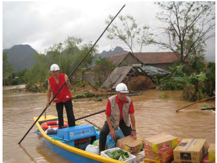
16 October 2013: In Quang Binh province, Red Cross staff transport relief goods by boat to Tuyen Hoa district.

Summary: Within two weeks of October 2013, central Viet Nam was hit by two category-1 storms, Typhoon Wutip and Nari, locally named storms Number Ten and Eleven. After Typhoon Wutip made landfall on 30 September and left behind significant damages and losses in six central provinces, Typhoon Nari struck Quang Nam and Da Nang provinces in the early morning of 15 October, with strong winds of maximum speed 194 km/h.