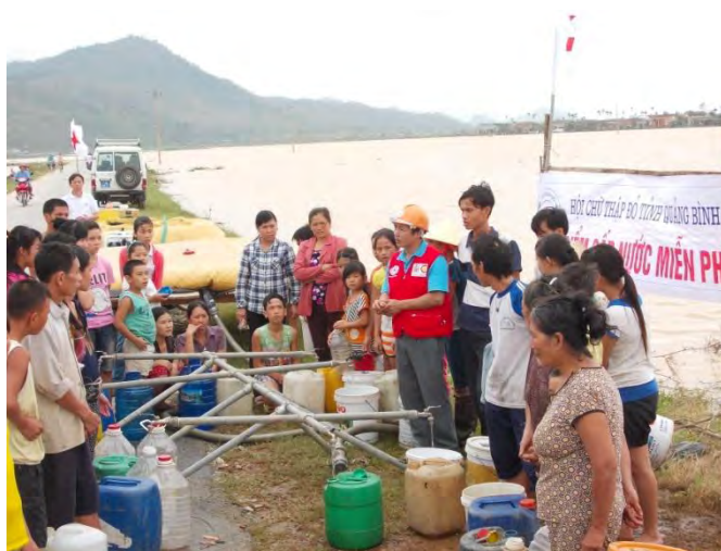
17 October 2013: Quang Binh Red Cross staff provide instructions to residents of Quang Son commune, Quang Trach district on how the water purification system functions.