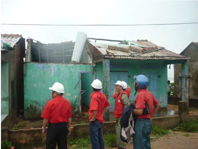
16 October 2013: In Quang Ngai, Red Cross staff carry out initial assessments in the affected areas.

Red Cross chapters in the affected provinces continue to frequently share their reports with VNRC headquarters, who have consolidated these to inform IFRC, in-country Red Cross Red Crescent partners, and inter-agency coordination mechanisms in order to coordinate the response in a timely and effective manner.