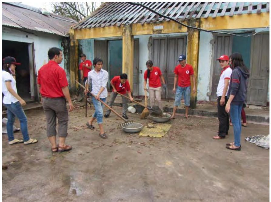
16 October 2013: Da Nang Red Cross volunteers help with clean-up in the community the day following Typhoon Nari.

Following the onset of Typhoon Wutip, Typhoon Nari and subsequent flooding in many areas, PDRTs were immediately deployed to carry out needs assessment and immediate relief activities, including assisting families with deceased or injured members, and damaged or collapsed homes. These relief activities include the provision of cash, household kits, shelter repair kits, instant noodles, rice, water filters, aquatabs and jerry cans.