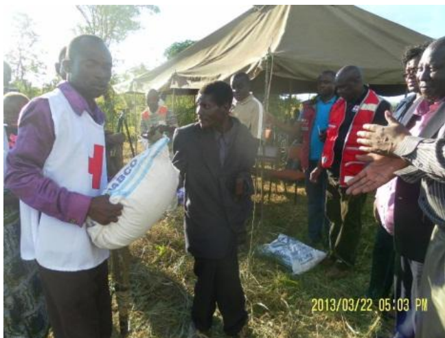
ZRCS volunteers distributing non-food relief items to affected families in Nagoma district.

The initial DREF budget of CHF 84,691 has been revised upwards to CHF 93,951 to include additional costs unforeseen at the time of designing the operation. The final financial report will reflect this increase in the budget. The additional costs include deployment of a relief Regional Disaster Response Team (RDRT) member for 30 days as well as engagement of field and logistics officers for 1 month to strengthen the capacity of the National Society to respond to the immediate needs of the affected communities in Nangoma as well as ensure the timely and accountable utilization of DREF funds.