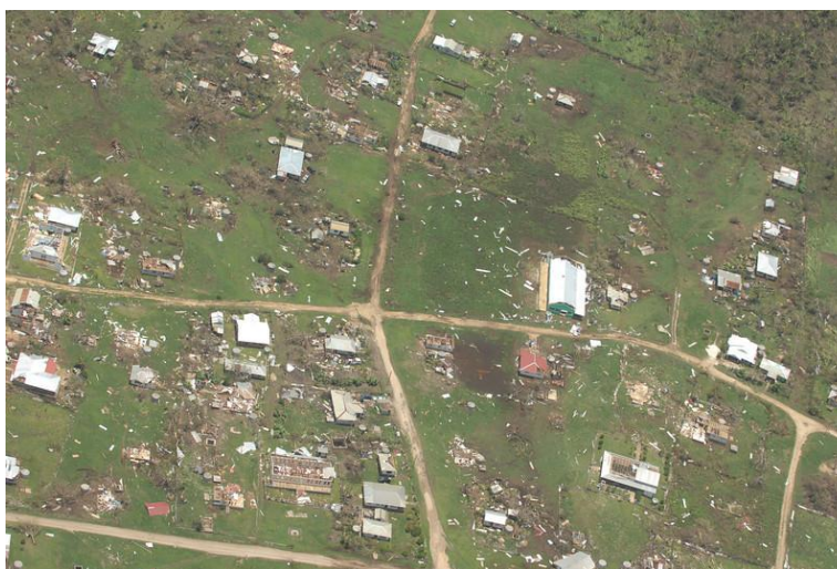
Damage to homes on Lifuka Island, Ha'apai, Tonga.

<click here for detailed contact information>