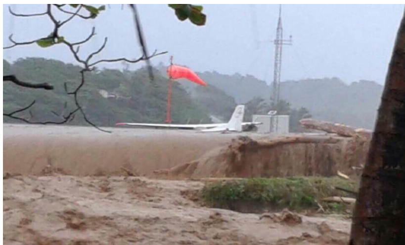
Flooded section of the airport.

<Click here for detailed contact information>