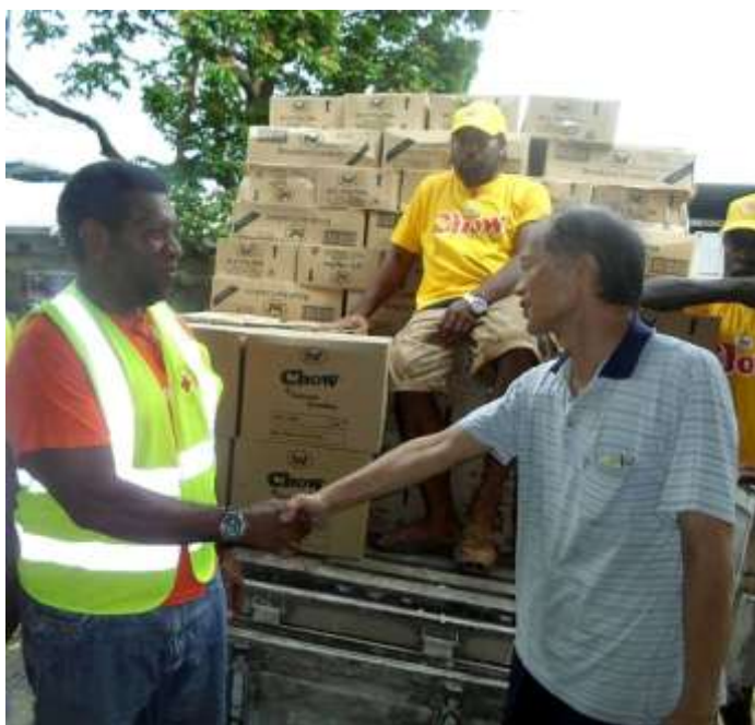
The Vanuatu Red Cross Society has pre-positioned relief supplies, including food, in preparation for Cyclone Pam.

Based on further information and rapid assessments to be carried out when safety conditions allow, the National Societies of Fiji and Solomon Islands may request for assistance through the IFRC international disaster response mechanisms.