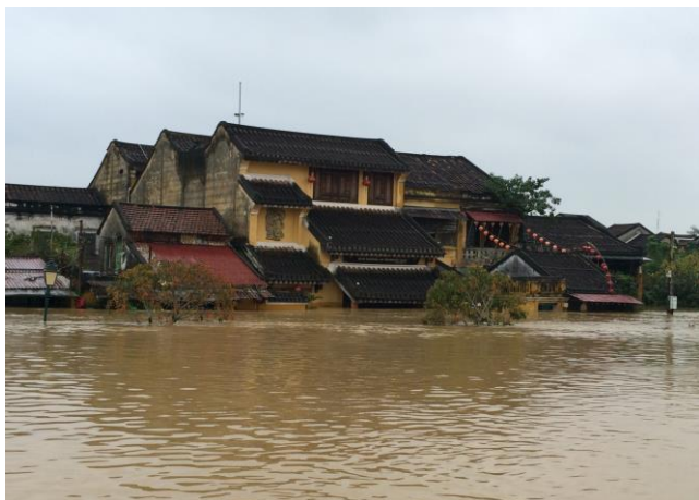
Hoi An city, Quang Nam is under the water.

According to the Chief of Office of the National Search and Rescue Committee, Typhoon Damrey was the strongest storm to make landfall in Khánh Hòa Province and the south-central region in the last 20 years. The recorded danger level of Damrey was higher than that of Typhoon Doksuri which pummelled the central region in September this year.