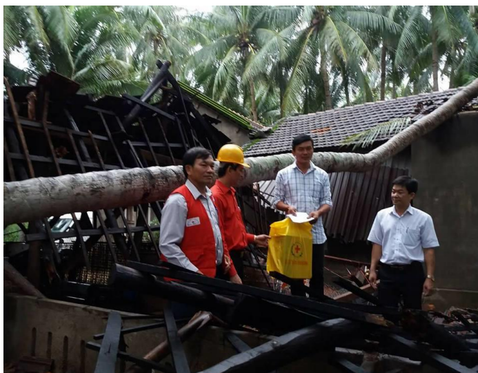
VNRC Binh Dinh Chapter visited and distributed relief and cash to a household whose house was collapsed in Hoai An, Binh Dinh.

The IFRC is supporting VNRC in disseminating updates to Movement partners. The IFRC continues to coordinate closely with VNRC and is ready to process a possible request for support.