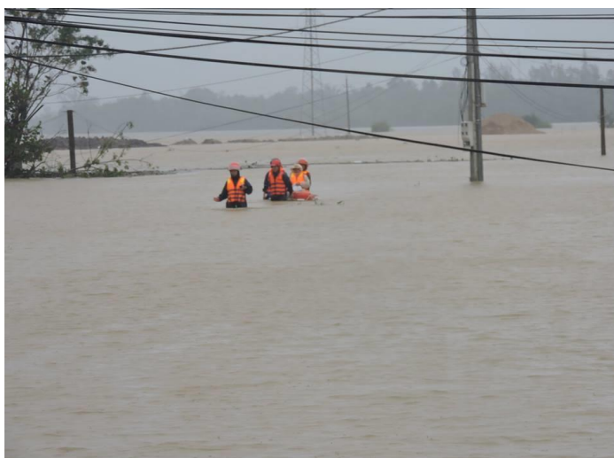
VNRC Quang Nam Chapter staff and volunteers are evacuating people to higher ground.