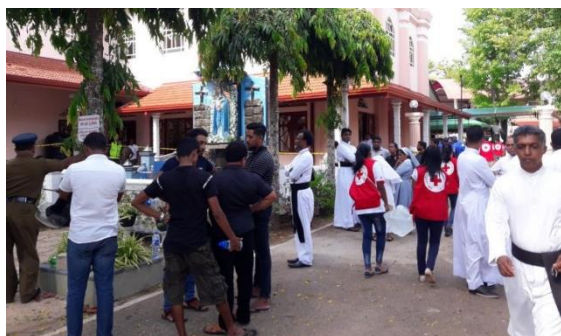
SLRCS trained volunteers from the Gampaha branch arrive at St Sebastian's church in Katuwapitiya in Negombo to offer first aid and relief services to people caught up in explosions, 21 April 2019, (Photo: SLRCS)

SLRCS is coordinating with authorities, and branches are on standby to offer more support. SLRCS has an extensive network of volunteers and a branch in each of the 25 districts of the country.