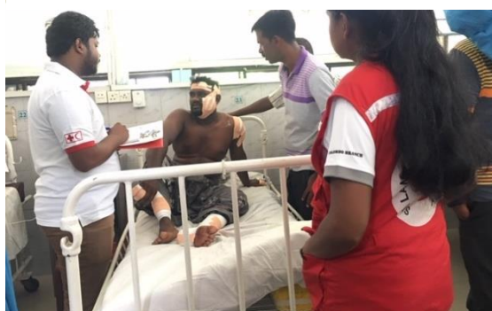
At Colombo National Hospital, SLRCS RFL (Restoring Family Links) teams help connect survivors with their loved ones, Colombo, Sri Lanka, 21 April 2019.