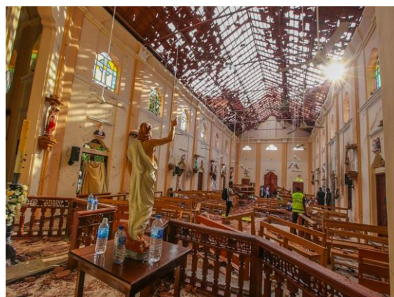
A view of St. Sebastian's Church damaged in blast in Negombo, north of Colombo, Sri Lanka, April 21, 2019.

On 21 April 2019, explosions at eight sites killed at least 359 people and wounded over 500 people 1 . The blasts occurred at three churches, including: St. Anthony's Church in Kochchikade, Colombo; St. Sebastian's in Katuwapitiya - Negombo, north of Colombo; and Protestant Zion Church in Batticaloa in Eastern province. The blasts targeted worshippers as they attended Easter Sunday services during the Christian holy week. Blasts also occurred at three hotels in Colombo, including Shangri La, Cinnamon Grand, and Kingsbury Hotel, all in the capital. Two more blasts occurred later as authorities were investigating. At least 45 foreign nationals are reported to be among the dead. Further, several other explosives were found and safely defused in Andiambalama and Kochchikade.