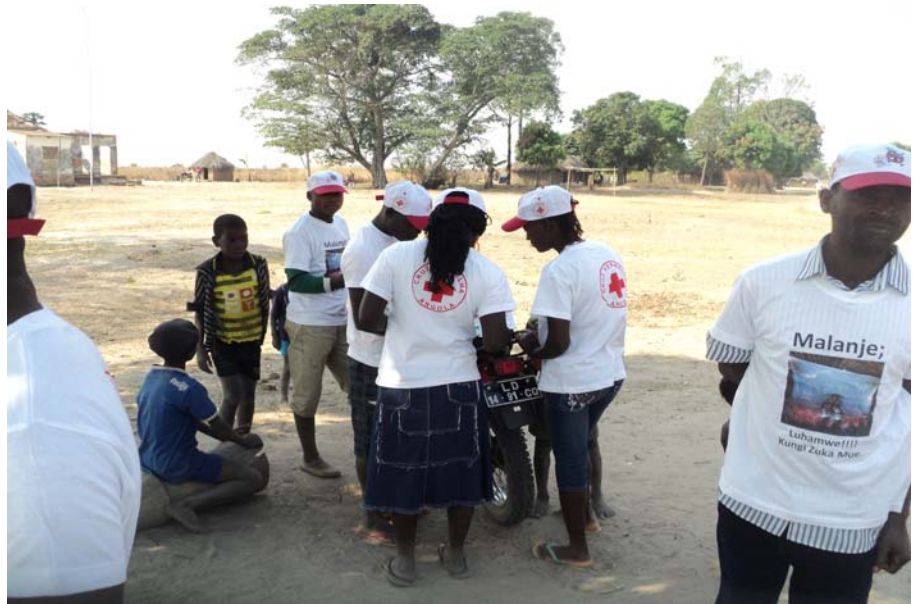
Photo caption and credits — Community sensitization session in Malene Province, Angola Red Cross Society

This report covers the period 01/01/2012 to 31/12/2012