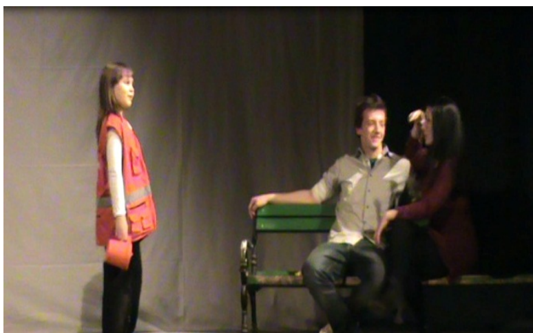
"Seven Principles" theater play: promotion of RC values. December 2011

With the support of the Federation, the Red Cross volunteers, lead by the National Society first aid Master trainer, organized and put on the "Seven Principles" theater play in order to promote the Red Cross values to different communities and to mobilize new volunteers. The play itself was organized through the Red Cross Youth Club Volunteers' initiative. 27 Red Cross volunteers implemented the show in two BiH cities (Lukavac and Srebrenik). The show attracted approximately 1,000