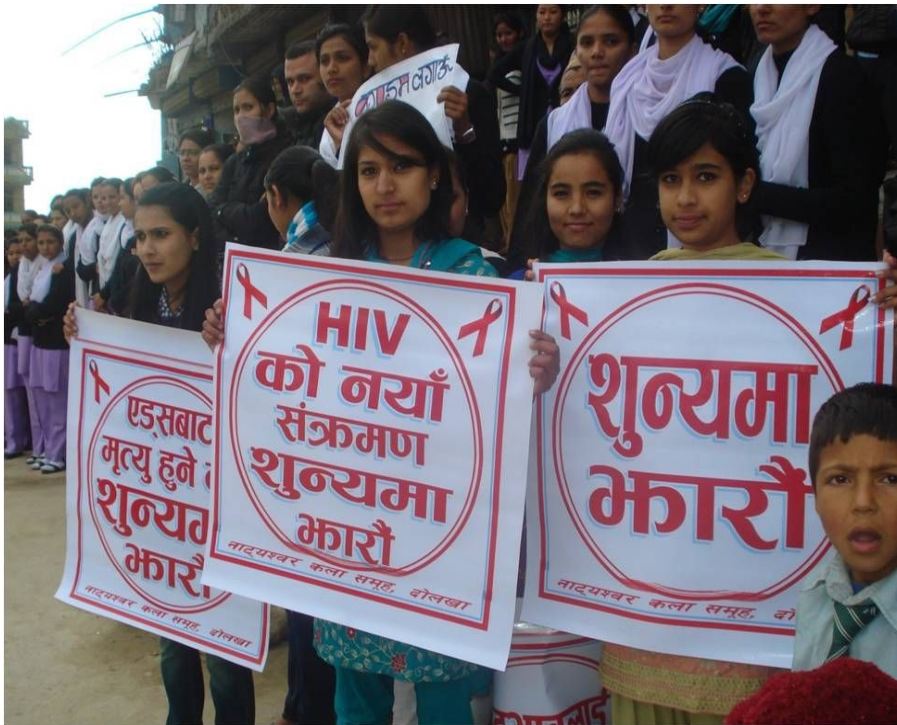
Students holding posters with HIV control messages in Dolakha district.

Altogether 59 CBHFA volunteers were selected and trained through Module 1 to Module 4 CBHFA training manual in two new districts of Siraha and Surkhet. The CBHFA volunteers provided first aid service to 1,020 people for basic injuries and illness during normal times and other situations like road accidents and social festivals in all project districts. The CBHFA volunteers have also been serving as a link between the communities and the formal health system by providing first aid service, health counselling and referral services.