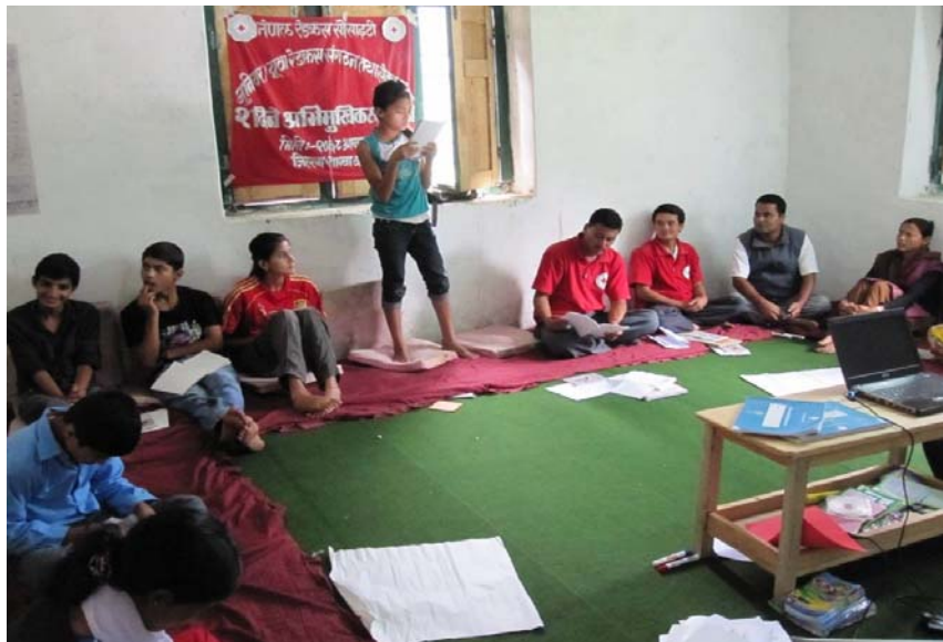
Red Cross junior and youth volunteers participating in an orientation session in Bajura district.

Junior/youth Red Cross programme orientation/workshops were conducted in two remote districts (Manang and Taplejung) separately. The purpose of the workshops were to disseminate Red Cross Movement knowledge and develop infrastructure for junior/youth Red Cross in remote districts. The district chapters have developed district level junior/youth Red Cross and plan to make their junior/youth Red Cross circles more efficient for involving in Red Cross and Red Crescent Movement activities. In total, 70 participants including 30 young people had actively participated the workshop in two districts.