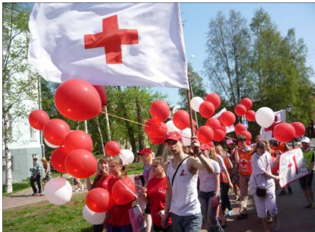
Photo caption and credits: Russian Red Cross TB public awareness campaign, Arkhangelsk. 2011/RRC.

This report covers the period 01/01/2011 to 31/12/2011.