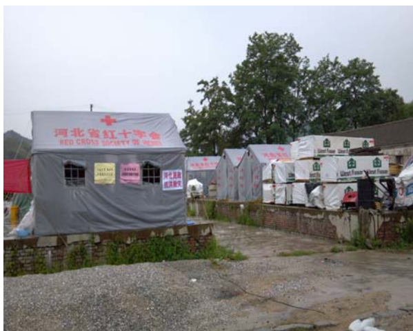
Tents sent by Hebei Red Cross.

On 2 August, Shandong Red Cross allocated CNY 200,000 to four cities (Rizhao, Weifang, Binzhou and Dezhou) for flour procurement, benefiting around 7,000 families which are 18,200 people altogether. The director of the Health and Relief Department is planning to go to these cities on 14 August to monitor relief distribution to beneficiaries and assess further needs.