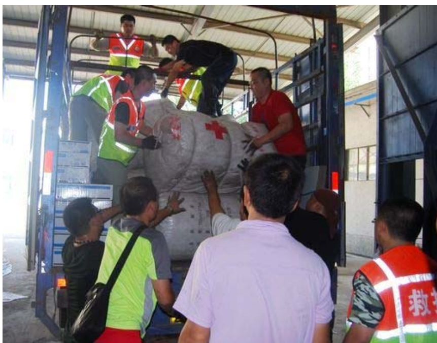
With the joint efforts of the Liaoning Red Cross staff and local volunteers, the relief items were loaded to the trucks and sent to the affected areas in Liaoning province within 48 hours after the torrential rain on 4 August.

<click here to view the map of the affected area, or here for detailed contact information>