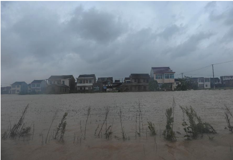
Farmlands at Yuelan Village of Changjie Town in Ninghai County, east China's Zhejiang Province were destroyed after the typhoon Haikui on 8 August 2012.

Typhoon Damrey made landfall in east China's Jiangsu province on Thursday night (2 August), bringing center winds reaching highest speeds of 35m/s and dumping rains at 50mm in Jiangsu and neighbouring Shandong province, forcing more than 292,600 people to evacuate to schools, relatives' houses etc. A total of 27,315 houses collapsed and another 27,050 were damaged in 122 villages in Shandong province.