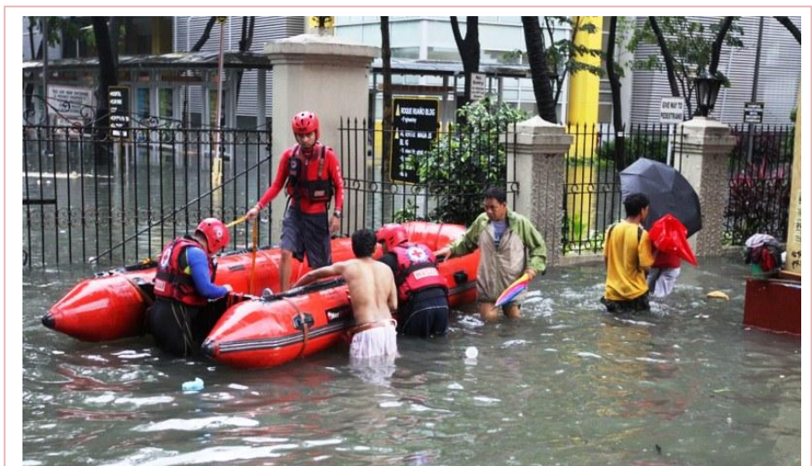
Some 100 staff and volunteers of Philippine Red Cross are currently on the ground providing first aid and relief assistance to flood-stricken families.

The national headquarters has activated emergency response teams and water search and rescue teams equipped with amphibian, rubber boats and trucks.