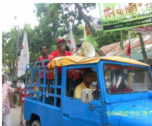
BDCRS volunteers are disseminating early warning message to the potential affected areas in Chittagong.

<click here for detailed contact information>