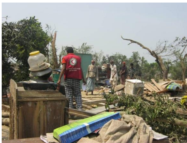
BDRCS volunteers actively assisting the community people in Brahmanbaria district who were devastated by the tornado.

<click here for detailed contact information; here for map; or here for photographs>