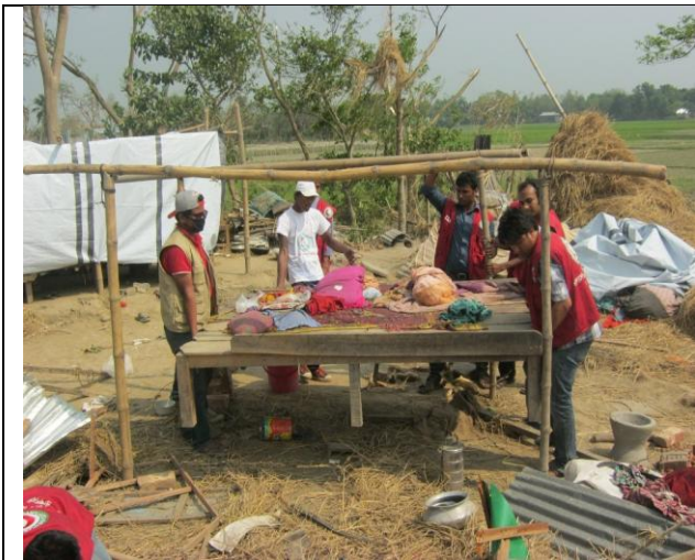
BDRCS volunteers helping the affected people.