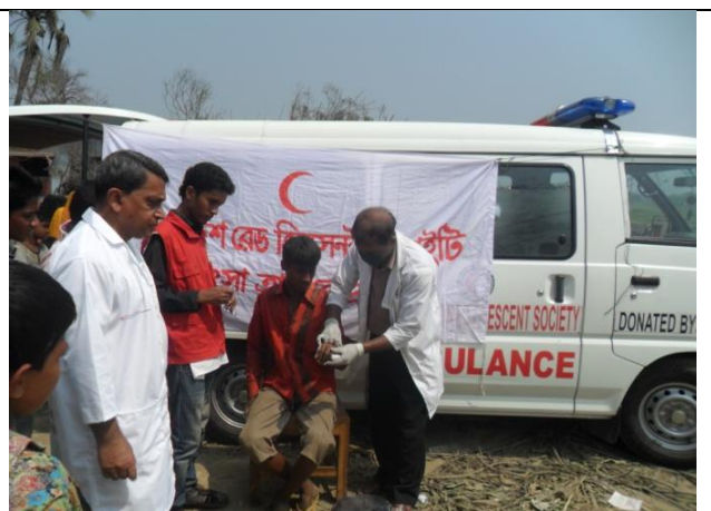
BDRCS mobile unit attending to the affected people in one of the villages.

The BDRCS local units and local authorities are exchanging information on assessing the extent of the damages resulted from the tornado as well as the needs of affected population and areas of needs which is to be met by the government.