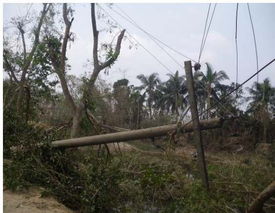
Fallen trees in Brahmanbaria district caused by the tornado.

Government reports indicated that rescue operations were organised with the help of Police, Boarder Guards of Bangladesh (BGB), Roads and Highway, Public works department (PWD) and local leaders. Two medical teams from Comilla cantonment are providing medical services to the victims. The injured are admitted and recieved treatment from Brahmanbaria Sadar Hospital and other neighboring hospitals/ clinics. Those who have lost their shelters have been relocated to a temporary shelter organised by the local administration. As stated on the DMIC report, the government has allocated relief cash grant BDT 20,000 (approximately CHF 240) for each family who lost a family member and BDT 5,000 (approximately CHF 60) for those who are injured.