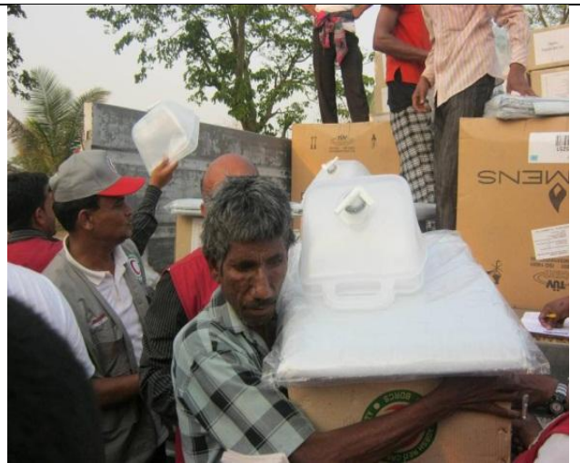
NFIs distribution by BDRCS district unit to provide relief to the affected people.