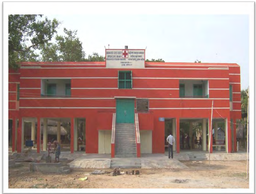
One of the Indian Red Cross community cyclone shelters in Odisha.