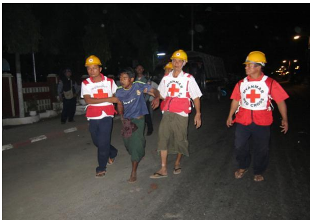
Local MRCS volunteers conduct search and rescue operations to assist affected people to evacuate to safer locations

As part of the immediate response, MRCS mobilized its disaster preparedness stocks which were provided by IFRC in December 2012. ICRC will replenish this emergency stock and stands ready to discuss any further support. On 30 March, ICRC will also deliver 2'000 family hygiene kits for distribution.