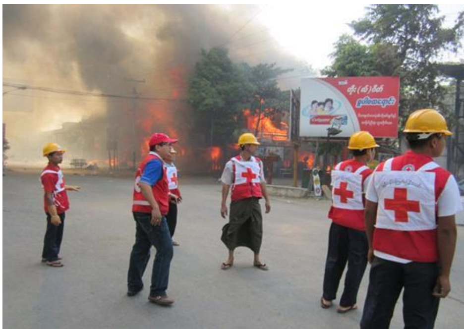
Myanmar Red Cross Society volunteers approach the situation with caution while conducting search and rescue operations in Meikhtila

The International Federation of Red Cross and Red Crescent Societies (IFRC) is not seeking funding or other assistance from donors for this operation. The Myanmar Red Cross Society will, however, accept direct assistance to provide support to the affected population.