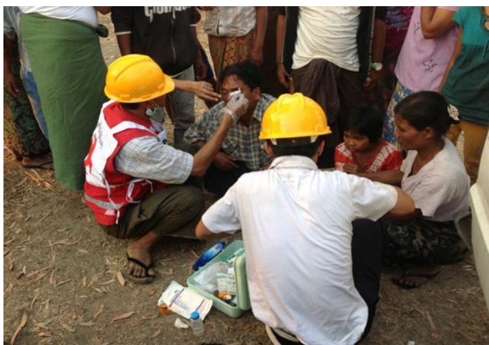
Local MRCS volunteers providing first aid services to those injured in the conflict

Since Friday, 22 March, ICRC has maintained a permanent presence in Meikhtila to assess the situation and evaluate potential support for MRCS activities. This has included providing the MRCS Meikhtila district branch with logistics and communication assistance, such as stretchers, visibility equipment, IT equipment, VHF radios, fuel for ambulances,