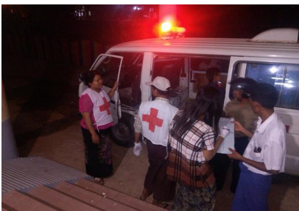
Local MRCS volunteers assist in transferring an injured person to the hospital

Three RCVs from Yangon, trained in restoring family links (RFL), were deployed and have facilitated 100 safe-and-well phone calls and helped to re-establish contact among 16 families. MRCS in Yangon is also processing five anxious-for-news enquiries. The RFL team plans to visit all camps by 31 March. The Red Cross branch of Meikhtila, with the supervision of regional Red Cross branch, deployed two RCVs from Pyinmanar, four from Thazi, six from Wondwin and 20 more from Meikhtila.