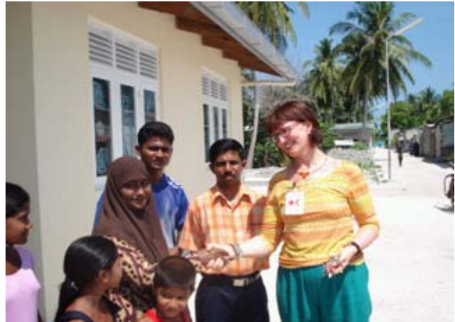
A member of the International Federation high level group for tsunami response hands over a house to a beneficiary family on Guraidhoo Island. The International Federation constructed 14 houses on Maafushi and 46 on Guraidhoo; these were completed in May and November 2006 respectively.

This security incident impacted on the International Federation's programmes by restricting some travel and consequently monitoring of projects. Project implementation was also affected by minor disruption to travel and transport of materials/equipment due to the arrival of the monsoon season. The Ramadan period – September- October 2007 – also affected operations through restricted business opening hours. International Federation activities were mindful of the month-long focus on prayer and fasting, and activities were adjusted. For instance, block making on Dhuvafaaru was stopped and focus shifted to training and community engagement.