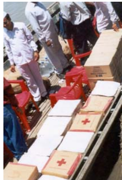
Relief material being ferried to far-flung areas during the floods in Maharashtra. The International Federation.

The IRCS is a regional pioneer in the formation of a tsunami early warning centre together with support from the Indian government and its neighbouring countries. Consultations between IRCS and the government have begun, and recommendations are being considered to reduce the risks and effects of disasters on those living in disaster prone areas. The state government of Tamil Nadu and Andhra Pradesh are coordinating the various tsunami recovery effort initiated by various national and international agencies.