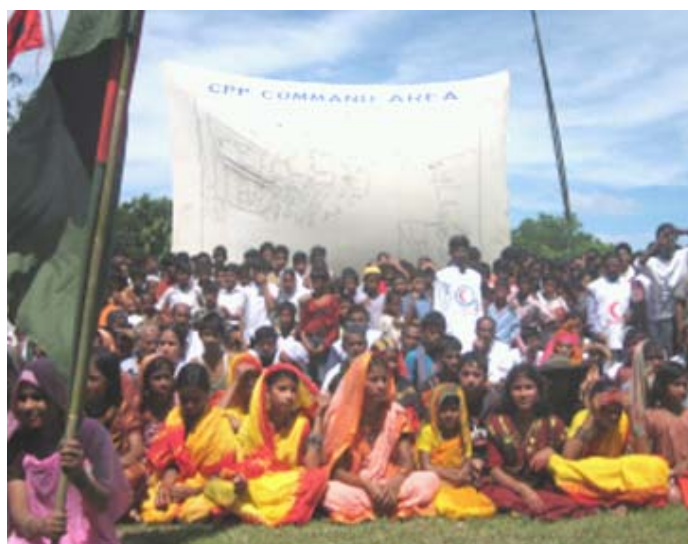
Communities taking part in the mock exercise conducted in the district of Nohakhali under BDRCSs cyclone preparedness programme. The International Federation.

In June 2007, apart from ongoing regular activities, a workshop was held on experience sharing of the early warning system prevailing in Bangladesh under the cyclone preparedness programme of which Bangladesh is a pioneer. Members of partner national societies such as the Red Cross and Red Crescent societies of Thailand, USA, Indonesia, Sri Lanka, Malaysia and representatives from the Asia Disaster Preparedness Centre in Bangkok, the government, United Nations and international non-government organizations participated in the workshop. The focus of the entire workshop was on 'tsunami'. A field visit was also arranged to Noakhali where a simulation exercise was organized on how a community, especially BDRCS volunteers, would respond following a cyclone or tsunami. A 'killa' (higher ground to take shelter, especially for domestic animals) was also visited during this occasion. The Red Cross Red Crescent Day on 8 May was observed on 31 sub-districts of all the above mentioned districts.