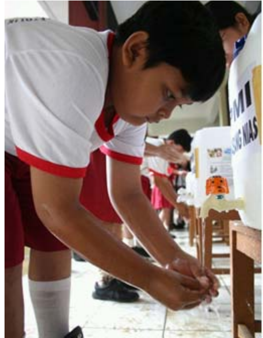
Children of five elementary schools in Gunung Sitoli, Nias participate in a ‘hand washing’ campaign.

Strategically developed to include primary schools in two of the three sub-districts, the International Federation has so far carried out first aid trainings in 21 schools educating 600 children and 60 teachers. By the end of 2007, PMI with support from the International Federation has held 12 radio talk show sessions, aired through Radio Republik Indonesia , a local radio station with Nias island-wide coverage. The radio talk show received tremendous response, with an average of 25 calls or text messages during the one-hour show relaying questions and comments from the listeners. As a result of the health campaigns, particularly village clean up activities, the local Puskesmas (community health centre) has noted a considerable decrease in the number of illnesses in the villages where the International Federation and PMI is active. This was expressed by Puskesmas staff present in village meetings which are held to evaluate the project’s progress monthly.