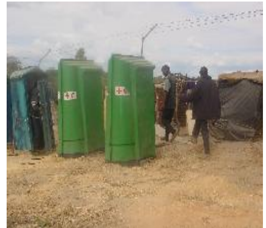
Temporary latrines at Caledonia Farm cam

The ZRCS role has been acknowledged through a statement by the Minister of Local Government and Public Works on 27 June 2005, and by local media. Zimbabwe Red Cross Society is the Movement leading agency in the response and is supported by a Task Force comprising both Federation and ICRC.