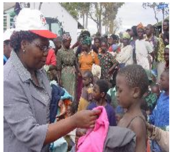
Secretary General of Zimbabwe Red Cross Society distributing clothing to beneficiaries

In addition to individuals currently living in 'transit' centres, large numbers of people remain camped where their houses were destroyed or in public areas of cities and towns, while others found alternative accommodation (at family and friends and/or new rentals). Other people are also reported to have moved to rural areas. The overall situation is very fluid and is constantly being monitored.