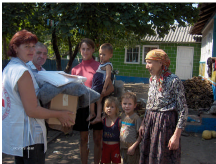
Moldova Red Cross is distributing humanitarian aid to affected families