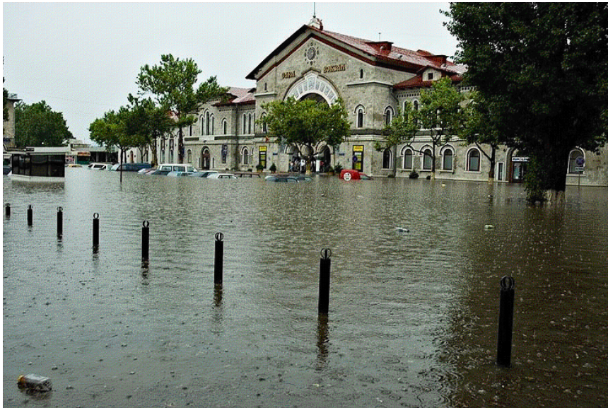
Flood waters in the capital of Moldova (Railway station Chisinau)

More than 170 settlements (which constitute 23% of the total number of settlements in the affected 15 districts) are located in the disaster-stricken area. The Moldova Red Cross reports that the total number of the affected people is over 6,500. A total of 102 families in Chisinau and about 300 families in 38 villages were evacuated by the government. The districts of Edinet, Criuleni, Briceni, Nisporeni, Riscani and the capital of Chisinau were hit the most. Preliminary estimate of damages and losses due to the disaster is approximately 95,605,000 Moldovan Lei (EUR 6,310,560.00).