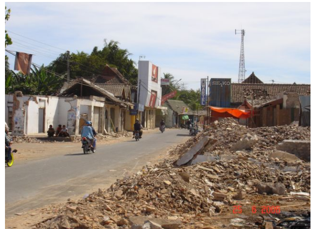
Imogiri, in Bantul district, was among the hardest hit by the earthquake.

An earthquake of magnitude of 6.3 on the Richter scale struck Yogyakarta and surrounding areas in Central Java at 05:54 hrs local time on 27 May 2006. It caused widespread destruction, injuries and loss of lives, with villages in the more remote areas south of Yogyakarta as well as in and around Bantul the most severely affected. The earthquake's epicentre was located some 20 km south-southeast of Yogyakarta at a depth of ten kilometres. Tremors were felt across the region, as far away as Semarang and Surabaya on the opposite coast of Java.