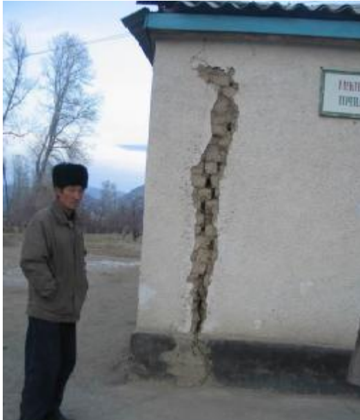
Cracks in this building of a local school are 5 cm wide

The earthquake with a magnitude of 5.7 degrees on the Richter scale occurred in Kyrgyzstan on 26 December 2006 at 0200 local time. The epicentre was located in the Teskey Alatau ridge close to the border of Issyk-Kul and Naryn provinces and 140 km east from the capital city of Bishkek. Tremors were also felt in Almaty in neighbouring Kazakhstan, with a magnitude of around 3.5-4 degrees on the Richter scale but there has been no damage registered.