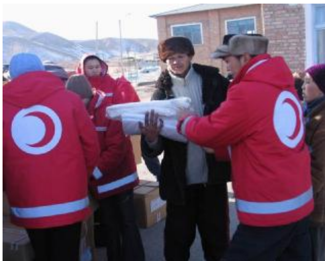
First distribution took place on 28 December as an immediate response by Red Crescent

Click here to return to the title page or contact information