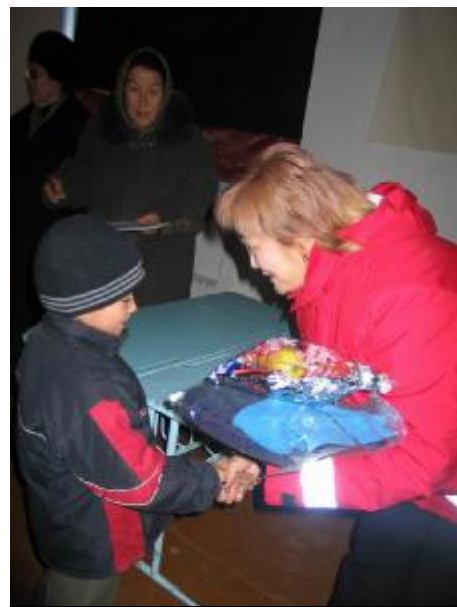
Affected children in Isakeevo village also received New Year gifts and warm clothes from RC

The Red Crescent is coordinating its response operation with the local response headquarters set up in Kochkor rayon. Kyrgyzstan National Society is also a member of the interagency commission that was established to monitor the situation developments on the disaster site.