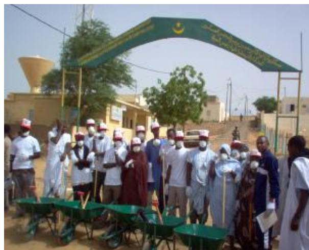
A group of volunteers at Aleg ready for town cleaning and sanitation activity.

<click here for the final financial report, or here to view contact details>