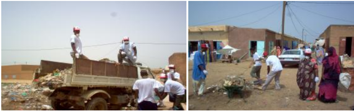
MRC volunteers involved in the City cleaning activity

kits were provided and proper hands washing campaign helped to contain diseases such as cholera at a low rate.