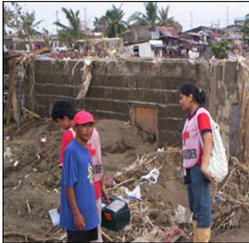
PNRC volunteers were quick to provide badly needed assistance.