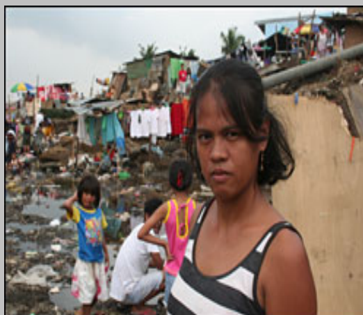
Some 70,000 families are made homeless by typhoon Xangsane.

This revision takes into account the findings and recommendations of four joint Philippine National Red Cross (PNRC) and Federation assessment teams that assessed the needs in the most affected provinces of Laguna, Camarines Sur, Albay, Sorsogon and Quezon during a two week mission. The teams concluded that the actual damage caused by Xangsane is far higher than originally expected and well beyond the coping capacities of the communities involved and of the competent authorities at local and provincial levels. The teams confirm that at least 70,000 houses were fully destroyed and another 189,000 severely damaged by the typhoon country-wide.