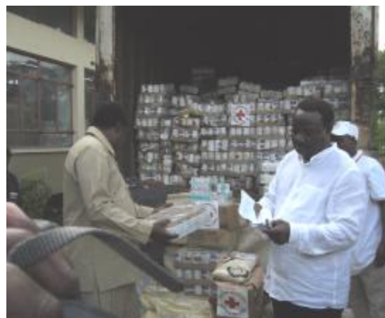
A TRCNS official handing over relief items to the Tanga regional commissioner

The national society has provided 300 cooking sets from the refugee programme stocks to support the affected families. Food items such as rice, canned fish, canned beans and pulses – donated by the Iranian Red Crescent – have been distributed in Tanga.