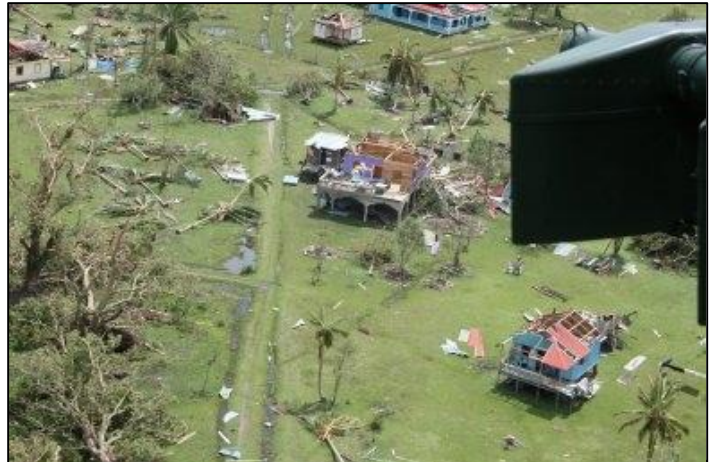
Hurricane damage in Sandy Bay on the Atlantic coast.

The near proximity of Hurricane Felix caused continuous rain and floods in Guatemala . The government agency for Disaster Reduction (Coordinadora Nacional de Reduccion y Desastre, CONRED) reported major floods in 17 communities in the municipalities of Puerto Barrios and Morales. These municipalities confirmed of having major basic sanitary infrastructure damages in their sewage systems and lack of drinking water. Consequently, drinking water has been contaminated creating grave health problems, especially children. There have been 781 families (3,901 people) affected and 914 houses destroyed by floods. Government institutions have started to clear the roads and bridges obstructed by the landslides. Monitoring and assessments have not been completed since some areas remain inaccessible due to damaged roads.