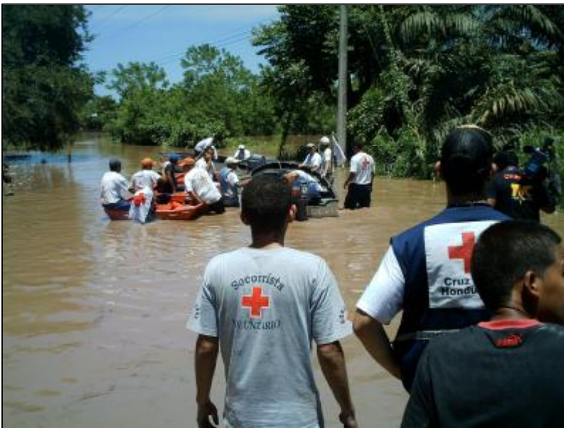
Floods in EL Progreso, Yoro Northern town of Honduras.

Felix, the second hurricane of the 2007 Atlantic season after last month's Dean, made landfall in northeastern Nicaragua on the morning of 4 September as a dangerous category five hurricane. During 4 September, the center of hurricane Felix moved inland over northeastern Nicaragua and Honduras . As of 5 September, Felix downgraded to a tropical depression severely affecting the countries of Honduras , Nicaragua , and Guatemala with heavy rainfall.