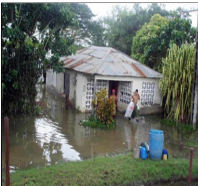
Flooded house due to Noel in the Granma Province, Cuba.

Shelters are being opened, but there is a lack of shelter management and capacity in this region. The metropolitan area of Cite Soleil opened at least seven shelters. The Civil Protection, the Haitian National Red Cross Society (HNRCS), with support from the Federation (in the form of 2 Regional Intervention Teams, or RIT, persons), the International Committee of the Red Cross (ICRC), the United Nations and other non-governmental agencies are providing support to these shelters. The United Nations offices in Haiti (Mission des Nations Unies