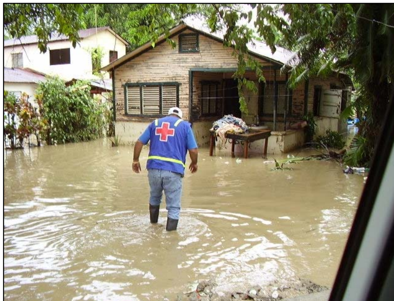
A flooded house due to Noel in the Dominican Republic.

The Spanish Red Cross has sent two additional water treatment plants along with two specialists in water and sanitation and an information officer. The three delegates in the Spanish Red Cross delegation office are assisting with the emergency.