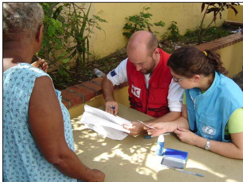
The International Federation and UNICEF performing relief distributions in Dominican Republic.

Several communities in the country reported flooding and emergency calls were received from various regions. Latest reports from the National Emergency Commission (Comision Nacional de Emergencias –CNE) indicate that 43,585 people have been affected. In addition, approximately 85 deaths are reported, and 48 people are reported missing. The majority of the casualties were reported in the province of San Cristobal, 30 km west from Santo Domingo. Serious damage was inflicted on houses and infrastructure: 16,024 houses have been damaged or destroyed and people are staying either in one of the shelters or with family and friends; At the time of writing, it is not clear how many shelters