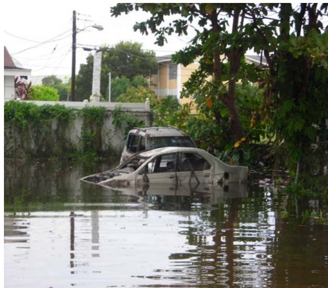
Flooded areas in the Bahamas.

The affected countries' Red Cross Societies, with support from the International Federation, continue to carry out needs assessments and distribute vital relief items to the affected people. The main focus of this revised appeal is on the immediate provision of relief items and identifying the early recovery and rehabilitation activities. There is also a need for support to these Red Cross Societies in psychosocial support and other health activities including prevention of the spread of dengue.