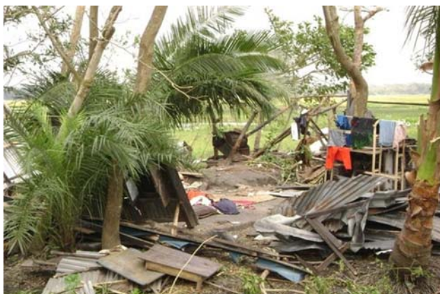
Tin-shed house destroyed in Gopalganj district

DMIC figures further show that the disaster affected a total of 5,488,216 people from 1,322,824 families and completely destroyed 458,429 houses (mostly tin-shed and thatched houses) in 30 districts in the southwest of Bangladesh. The affected areas include 200 upazillas (sub-districts) and 1,700 unions (the smallest administrative unit).