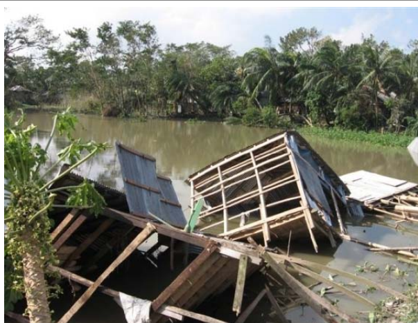
A totally-destroyed house in Gopalganj district