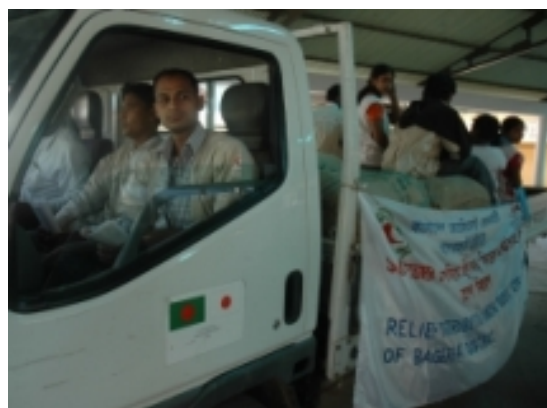
BDRCS relief leaving for the coast of Bagerhat, carrying rice and molasses

Due to the urgency of the operation, 20,000 food packs, each consisting of 20 kg rice, 5 kg dhall, 2 litres cooking oil, 1 kg salt 1c of saree and 1 pc of lungi, have been diverted from the flood operation, and are currently enroute for distribution to those most in need.