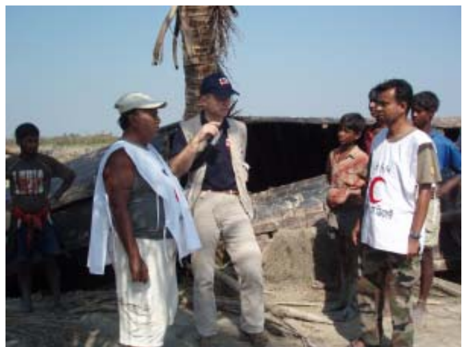
FACT conducted assessments in the affected areas along the coastal districts.

For this operation, two members from the South Asia regional delegation have already arrived in country and the other two members will arrive and be operational by the end of this week. A recovery member of the FACT arrived from the Maldives delegation on 21 November and on 22 November, the four member British Red Cross Logistics ERU arrived along with a communications officer. However, the two resource persons from Kuala Lumpur (the acting head of the Zonal Planning Monitoring and Reporting Unit and the Disaster Management Unit delegate) have returned to Kuala Lumpur.