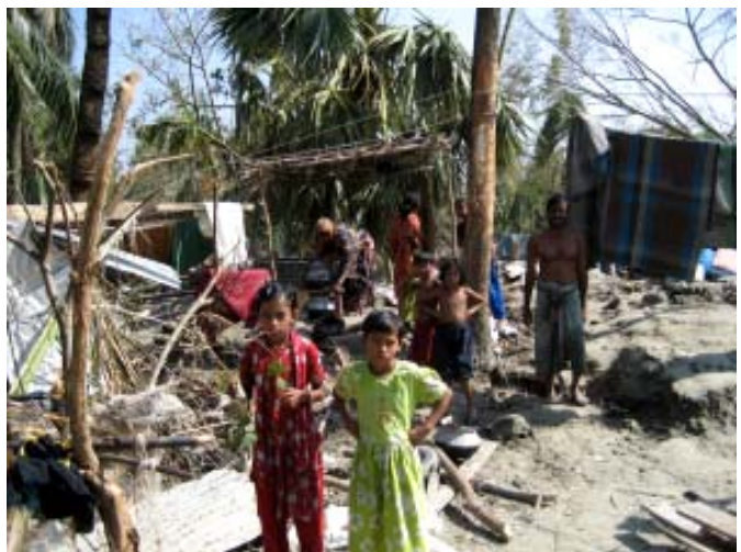
Affected people in dire need of food, water and shelter.

The affected people are in dire need of immediate relief in terms of food, potable water, warm clothing and shelter. The situation is further exacerbated by the onset of winter expected in less than a month. Over 300,000 children reside in the six most affected districts, and they are threatened by many cold-related and waterborne diseases like pneumonia, diarrhoea and cholera. Furthermore, a shortage of pure drinking water has given rise to acute waterborne diseases like diarrhea among the wider population. FACT assessments report that many ponds are contaminated with rotten trees, carcasses and dead bodies.