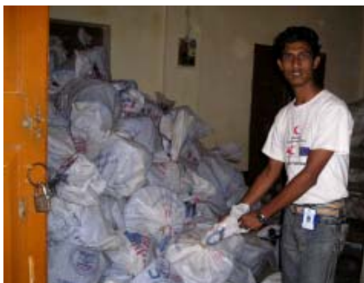
Goods for distribution being prepared from the branch warehouse, in coordination with local authorities and BDRCS cyclone preparedness volunteers.

Along with BDRCS medical mobile teams, a ten-member Bangladesh Army mobile medical team is currently working to treat patients affected by diarrhoea and other diseases. According to media reports, the Army mobile medical teams are providing health services to over 200 patients a day.