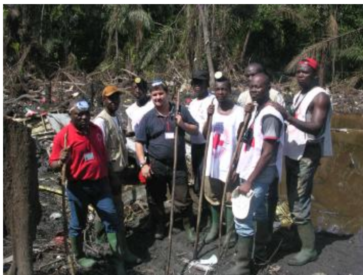
The Federation's Central Africa Regional Representative with Cameroon Red Cross volunteers on the field.

Volunteers who participated in the operation appeared morally affected by the end because of what they had seen. Thus Red Cross authorities supported by the Federation's Central Africa Regional Representation saw the need to call in psychologists to counsel and take proper care of them. It is in this respect that the Federation's Regional Representative for Central Africa joined the volunteers in the field. The National President of Cameroon Red Cross Society did the same later