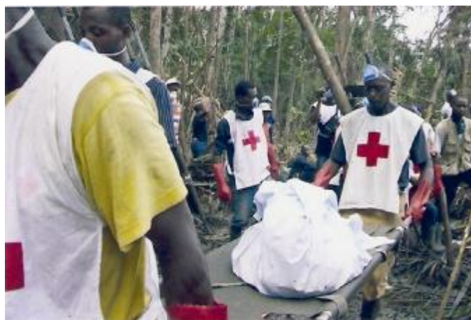
Cameroon Red Cross volunteers at the scene of the Kenya Airways plane crash in May 2007.

Immediately after it was announced that the plane had disappeared from the radar, Cameroonian authorities organized a search and rescue operation. After 48 hours of search, the wreckage of the plane was found in a swampy area in Mbanga-Pongo, 23 kilometres from Douala. Reports from Cameroon Red Cross Society (CRCS) volunteers and first-aid workers, who were among the first to reach the macabre scene, indicated that none of the 115 passengers survived. It is suspected that bad weather could have caused the plane to crash.