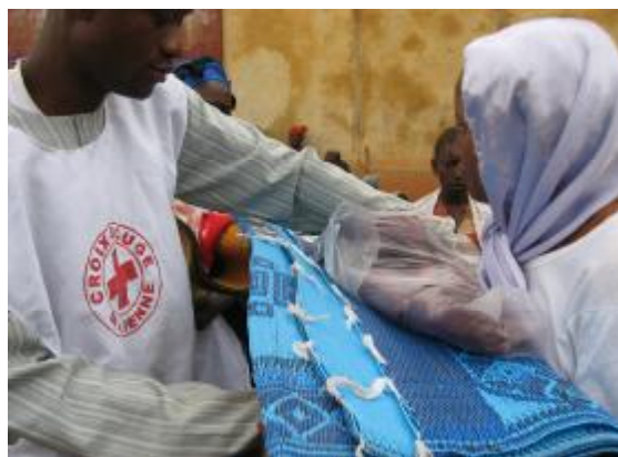
Distribution of NFI by the Red Cross volunteers

<click here for the final financial report, or here to view contact details>