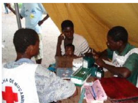
CVM volunteers delivering health, and WatSan -related services and advice.

At this early stage of the emergency operation, the CVM/ Federation have mainly concentrated their efforts on rapid assessments for relief actions. Recover action will be considered shortly, once the immediate needs are accommodated.