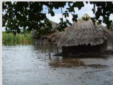
Village huts surrounded by flood waters.

Operational Summary: Approximately 139,944 people are currently accommodated in resettlements (52,514) and 87,430 in accommodation centres because of the floods in Mozambique. The Mozambique Red Cross Society (CVM) 1 is playing a crucial role in disaster response through its volunteer network assisting with relief, health and water and sanitation activities in accommodation centres in the four most affected Provinces; Zambezia, Manica, Sofala and Tete.