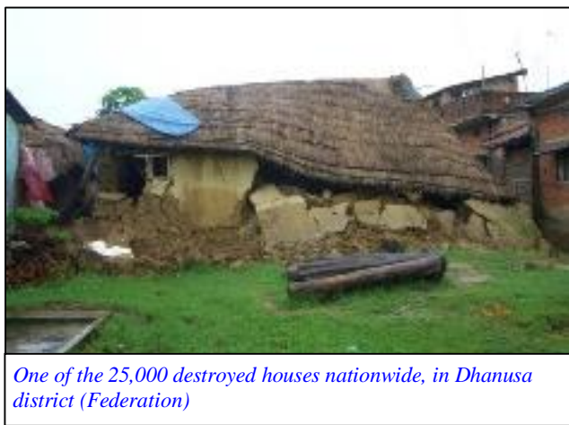
One of the 25,000 destroyed houses nationwide, in Dhanusa district

The Nepalese government has given NRCS the responsibility to act as the main implementer for relief distribution in response to this situation. The National Society has been actively participating in the coordination with Government authorities, UN agencies and other humanitarian actors in order to ensure an efficient and effective relief operation.