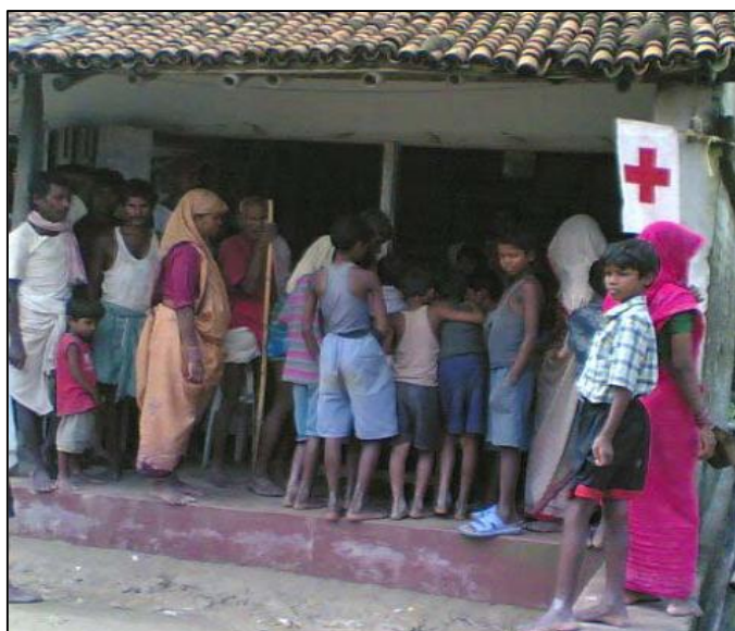
Flood-affected community members collecting non-food relief items at the NRCS district chapter in Saptari, Central Terai District. Federation

Joint teams comprising the NRCS and representatives from various other organizations have launched need assessments in coordination with the District Disaster Relief Committees. Based on these assessments, the following needs of the affected families have been identified: (see next page)