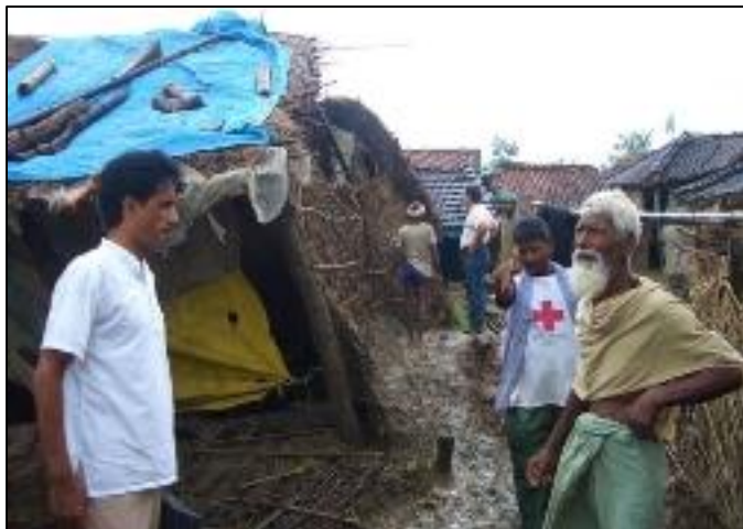
Improved repairs with a tarpaulin to a damaged house in Dhanusa district (Federation)

As the main actor for relief distribution, the NRCS has mobilized its local network. At the onset of the floods, all NRCS district chapters in the affected areas immediately mobilized their staff and volunteer teams to distribute relief supplies, both food and non-food items, such as clothing, plastic sheets and tarpaulins.