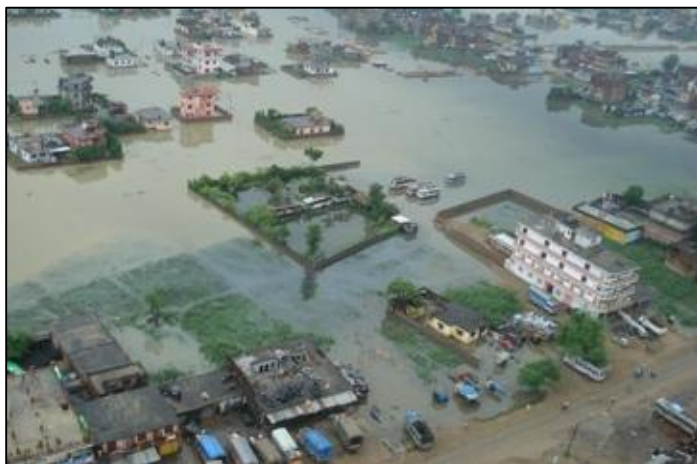
Floods in Nepalganj, Banke District.

The latest information from NRCS, government and other NGOs and UN sources indicate that 164 people have died and 94 were injured as a result of the landslides and floods. Between 24,000 and 25,000 families are currently displaced, due to 24,826 houses being totally destroyed by the floods. In addition to these houses which were totally destroyed, 45,725 houses have been damaged by flood waters. The approximate total of all affected houses is 70,551.