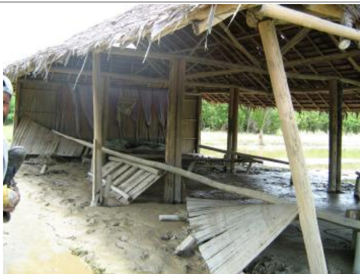
Houses and shelters were destroyed by the floods, such as this one in the Oro Province.

Summary: Severe flooding from heavy rains that started on 13 November 2007 (brought on by Cyclone Guba) inundated the provinces of Oro and Milne Bay. Access to the province of Oro is only possible by boat or helicopter, as roads leading to the airport and Oro Bay have been destroyed, cutting off the provincial capital of Popondetta and surrounding districts. Preliminary data released by the government of Papua New Guinea indicate that an estimated 53,000 people are adversely affected by the floods. Up to 13,000 people have been made homeless, and over 70 deaths have been reported, with the numbers likely to rise further. While the province of Oro remains difficult to access and information is limited, the PNGRCS, with the assistance of the Federation and partner national societies, have mobilized resources and aid immediately, in preparation for the relief effort to be undertaken in the coming days.