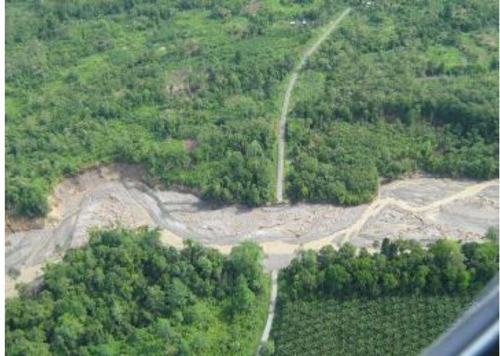
Swollen rivers devastated more than 12 important bridges and roads that linked towns to each other, Oro Bay and the airport.

Bridges and culverts leading to smaller towns and villages have been washed away, making assessment and assistance to the most vulnerable more difficult. Crops and homes have been devastated, and the security situation has deteriorated, resulting in army and defence forces mobilizing human resources to maintain law and order. Preliminary data released by the government of Papua New Guinea indicate that an estimated 53,000 people are adversely affected by the floods. Up to 13,000 people have been made homeless, and over 70 deaths have been reported, with the numbers likely to rise further. Reports have been received that the displaced have established two camps on the outskirts of Popondetta.