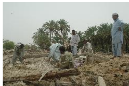
People have lost their houses and will require support to rebuild them.

Severe flooding resulting from heavy rains that were exacerbated by a cyclone in late June 2007 has affected over two million people in Pakistan. The Baluchistan Province is most affected, with 23 of its 29 districts impacted. The National Disaster Management Authority (NDMA) has placed the figure of affected people in that province alone at two million, with 130 deaths. The Sindh Province, where at least 311,570 people have been affected and 115 deaths confirmed, has also been hard hit. Five of its districts have been affected. Infrastructure has been severely undermined with roads and bridges damaged or destroyed and telecommunications out in many areas since 26 June 2007.