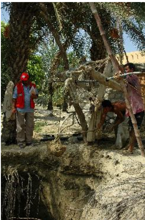
A member of the PRCS/Federation assessment team inspecting a damaged water-well in Koshkalat union council, in Kech District, Baluchistan.

Health: Most health posts visited by the FACT reported cases of acute diarrhoea and diarrhoeal diseases. Other health concerns reported are dehydration and sun stroke, skin diseases, snake bites, respiratory infections and malaria. Available health posts in the affected area are mainly run by male staff and as a result, women are reluctant to use their services or cannot access them. There is thus the need to provide health services which take into consideration the special needs of women and children. A disease surveillance system should also be put into place.