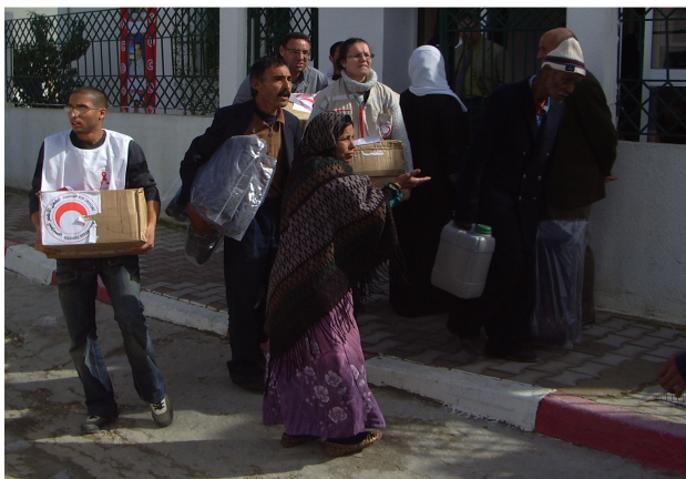
Tunisian RC distributed significant quantities of relief items to the people affected by the floods in the country

As a result of this DREF operation, important quantities of relief items were distributed to more than 500 families (composed from three to five members) within the affected regions. The distributed items were in accordance with the immediate needs of the affected people.