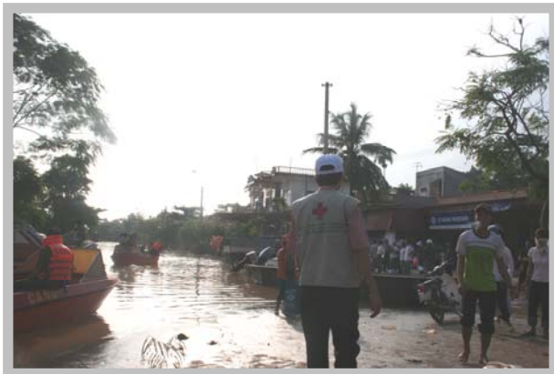
VNRC volunteers in the Thanh Hoa province. VNRC distributed relief supplies to villagers stranded for over three days in floods following typhoon Lekima.

The Federation's Southeast Asia regional delegation has deployed a regional disaster management programme officer together with a regional information delegate to Viet Nam.