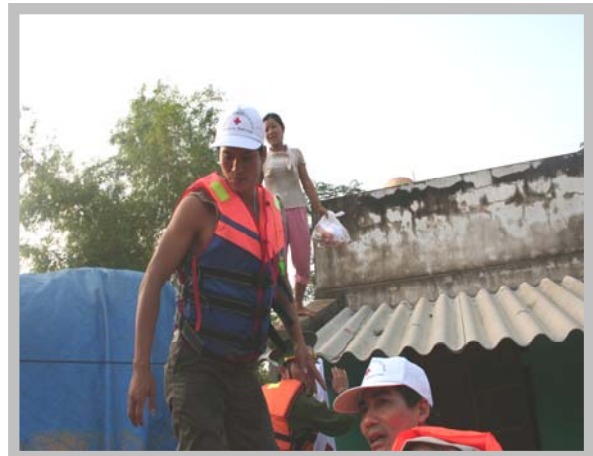
VNRC volunteers distributing emergency food aid and medicines to villagers in the Thanh Hoa province. Damage to a dam forced villagers to seek refuge on trees and rooftops in the surrounding areas.