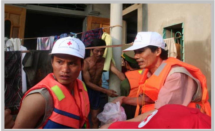
Red Cross volunteers facilitate distribution of emergency food aid and medicines to flood-affected people in the Thanh Hoa province.

Reports from local authorities show final damage estimations of ten provinces totalling up to VND 3,056 billion (CHF 223.5 million or USD 189.7 million). Among these are the Thanh Hoa, Nghe An, Ninh Binh, Ha Tinh, Quang Binh, Hoa Binh, Son La, Phu Tho, and Yen Bai provinces at a total of VND 575 billion (CHF 43 million or USD 36.4 million) while in the Thanh Hoa province alone, total damages are calculated at VND 520 billion (CHF 38.8 million or USD 33 million).