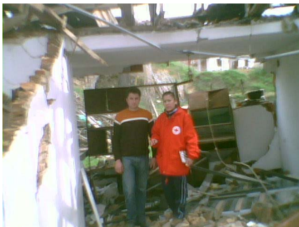
The owner of a totally destroyed house is visited by a Red Cross volunteer in the village of Gerdec.

This operation is expected to be implemented over three months, and will therefore be completed by 19 June 2008; a Final Report will be made available three months after the end of the operation (by 19 September 2008).