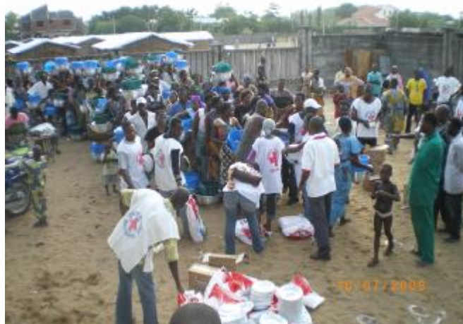
Distribution of non food items to fire victims

In May, the Red Cross of Benin assisted about 996 victims of the fire in Donaten, a fishing settlement in Cotonou. The affected people received first-aid assistance, psychological support, health education and assistance in the reconstruction of their houses. For an effective intervention, the national society trained and deployed its volunteers in the community to carry out health education and assist some of the victims in the reconstruction of their houses.