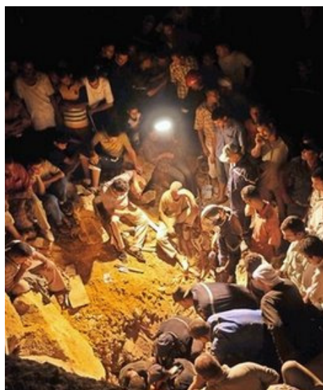
Search and rescue works are being carried out 24 hours.

Summary: Up to 200 people are feared to have been buried under their homes after rockslides crushed a shantytown in the eastern Duwayqa area on 6 September 2008. Reports indicated that at least eight boulders - each estimated to weigh about 70 tonnes - fell from the towering cliffs overlooking the district at about 09.00 local time (07.00 GMT). 51 people have been declared dead and 57 people injured. 50 homes have been destroyed in the impoverished and densely populated Manshiyet Nasr neighbourhood. Some people are believed to be still trapped under the rubble and the police have cordoned off the area. The toll is expected to rise drastically, considering the number of missing, the dust and the difficulty of the search and rescue operation (difficult access for heavy equipment, high tensions between local population and governmental authorities).