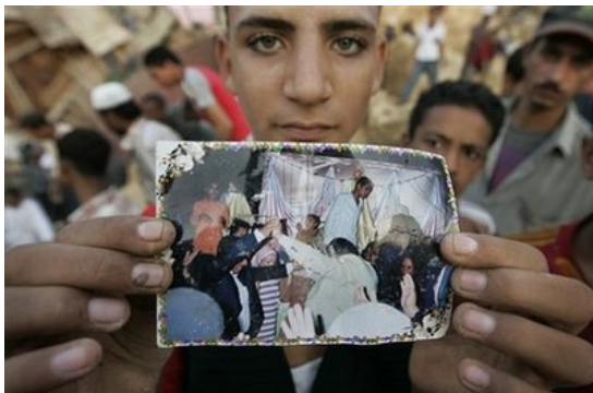
Relatives are looking for the people who are missing.

The Egyptian RC temporary camp is now fully operational. With the new families being registered in the camps and additional ones expected, relief items such as tents, hygiene kits, mattresses, mats and basic household materials are urgently needed. The National Society stocks have been depleted and need to be re-constituted.