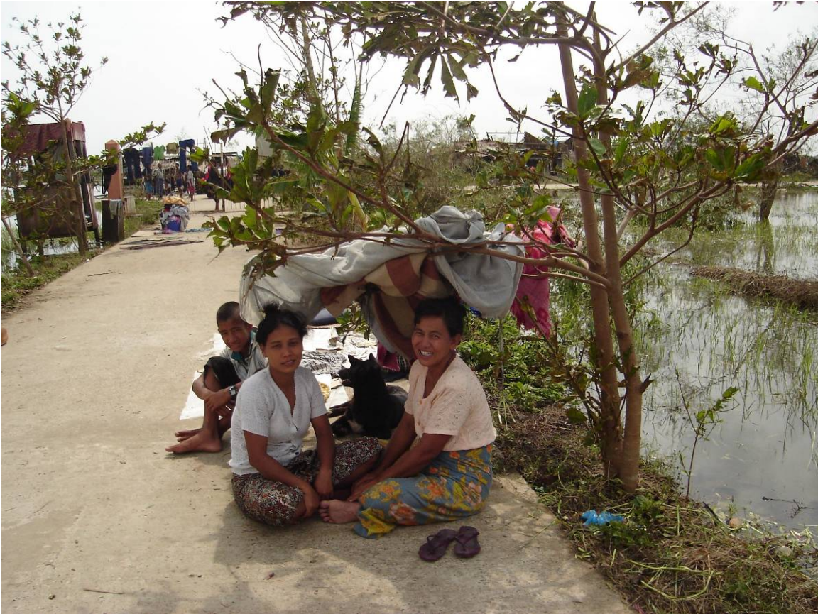
A blanket above our heads: many people are showing remarkable resilience and good grace despite losing family, friends and possessions.