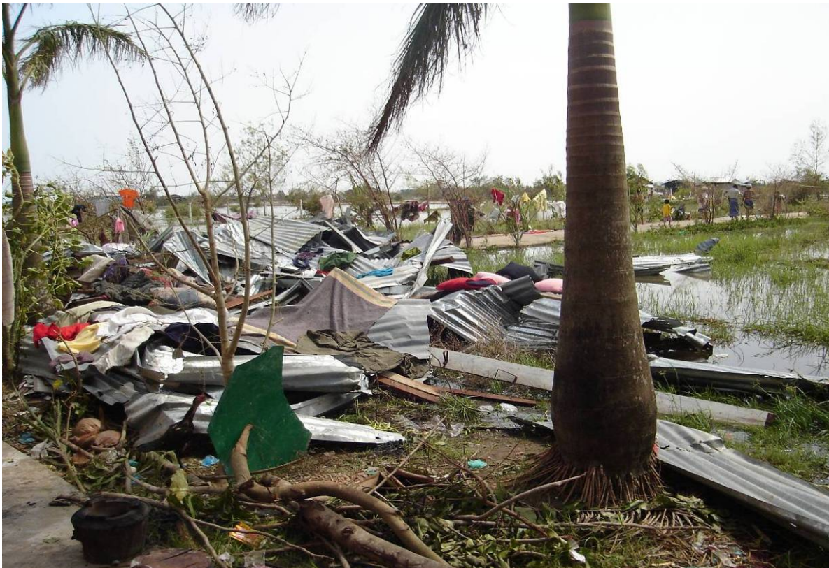
Strewn debris: Corrugated iron roofing was tossed around like paper by the storm.