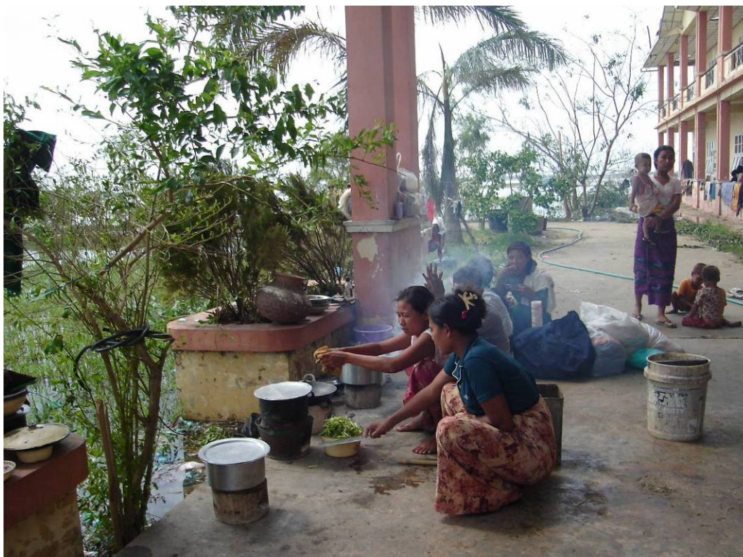
Meal time: Families taking refuge in a school, cook on the verandah outside their classroom 'homes.'

< Click here to link to the donor response list > < click here to link to contact details >