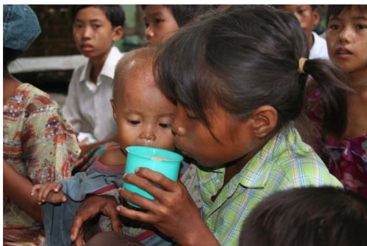
Temporary relief: A young girl and her baby brother savour a drink at one of the many shelters dotted around the delta.

The assessment picture of needs on the ground is improving. Much more is known about the situation in Labutta, Ngapudaw, Maungmya and Yangon. There are still significant gaps in knowledge in terms of Bogale (particularly south Bogale), Mawlamyinegyun, Dedaye, Kyaiklat, Pyapon, camps in Wakema (seven camps with people moved from Bogale). A more comprehensive picture is needed on local group action and the breadth of government support.