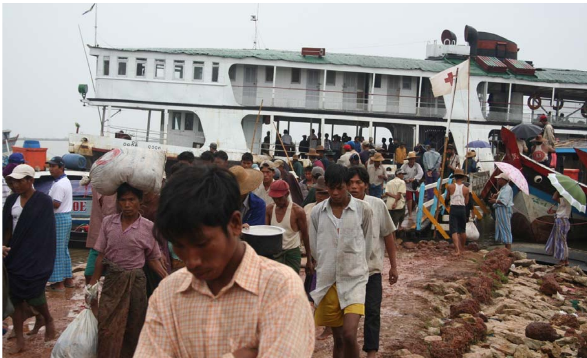
Basic port of call: A boat packed with Red Cross Red Crescent relief supplies is unloaded in the Ayeyarwady delta.

In terms of FACT/RDRT, the total team is 22 members, with seven in Yangon and 15 in Bangkok. In Yangon, FACT is covering all important cluster meetings (health, water and sanitation, shelter, food and nutrition, early recovery and logistics).