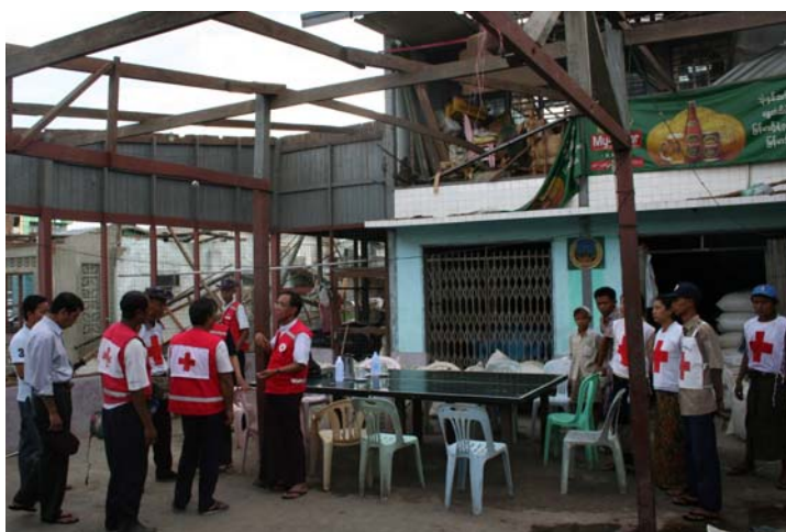
Have table will work: MRCS president talks to volunteers at their temporary street office in Bogale; this scene sums up the inspiration and tremendous fortitude of Red Cross volunteers in such difficult circumstances. (International Federation).

MRCS continue to mobilize volunteers on a daily basis; around 100 are working within warehouses in Yangon and 20 to 50 volunteers are reported to be supporting assessments, relief distribution and medical