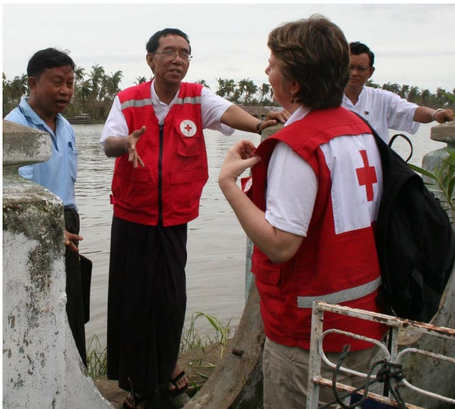
Present where the needs are: the MRCS president and Federation head of delegation tour the delta to see first hand the scale of the task ahead of communities to recover and the responsibility the Red Cross Red Crescent has in supporting them.

Following discussions with contributing partner national societies, the International Federation is looking at alternative ways to support the deployment of emergency response unit equipment coming