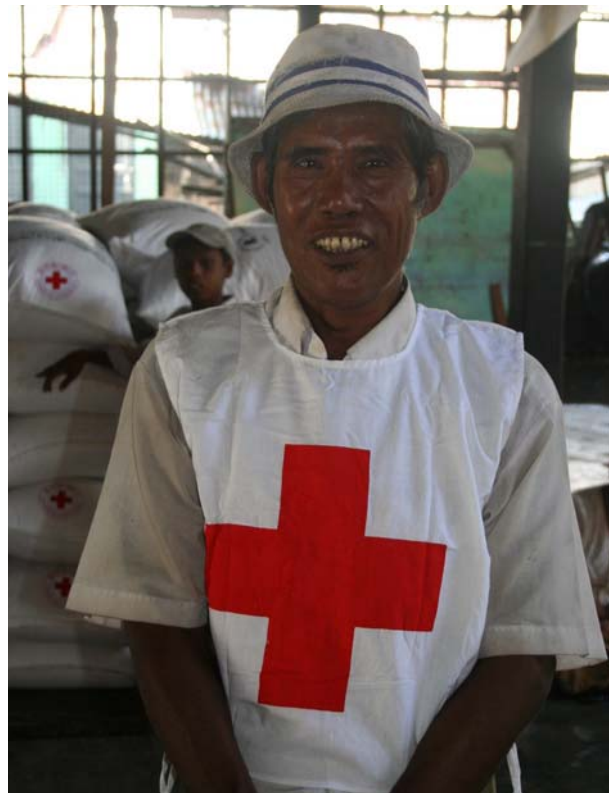
Proud: A Myanmar Red Cross Society volunteer takes a break between loading supplies. (International Federation).