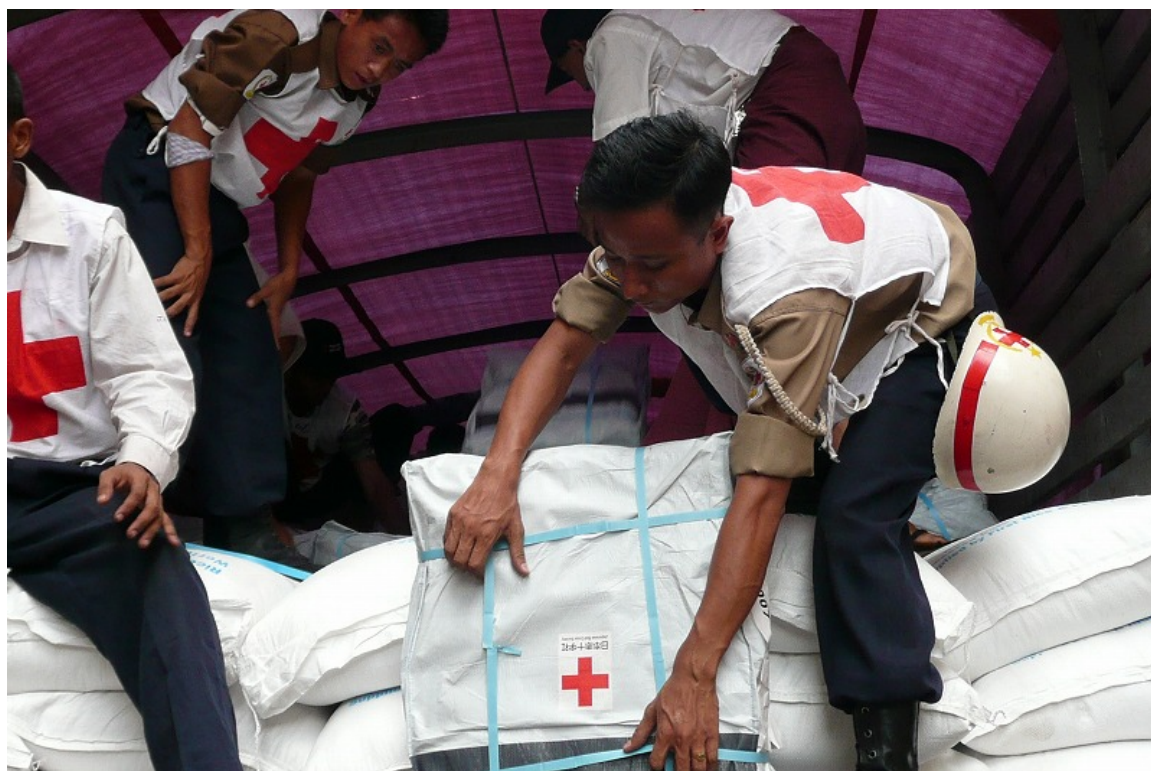
Volunteers from the Myanmar Red Cross Society load relief items onto a truck bound for the delta region.

<Click here to link to the donor response list> <click here to link to contact details >