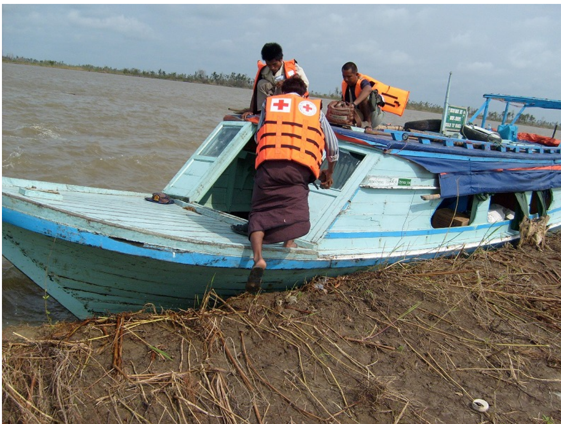
Red Cross volunteers board a boat loaded with relief supplies for families in the Ayeyarwady delta. (International Federation)

Limited sea freight services to Myanmar have been resumed, even though port facilities are presently regulated and only receiving 20-foot containers at maximum.