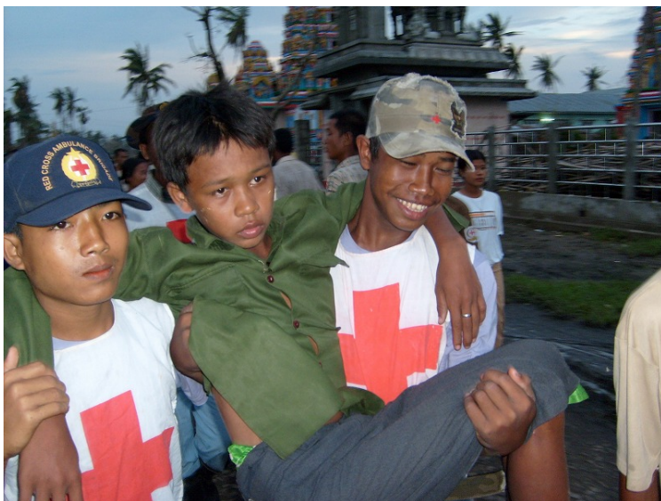
A young boy in need of medical assistance is being carried by two local Red Cross volunteers. (International Federation)

In Bogale township, more than 170 volunteers are tirelessly supporting Red Cross Red Crescent operations. In addition, they are helping other humanitarian organizations, such as German Agro Action and Action Contre La Faim, to distribute their relief. MRCS volunteers are leading the way to access the affected villages