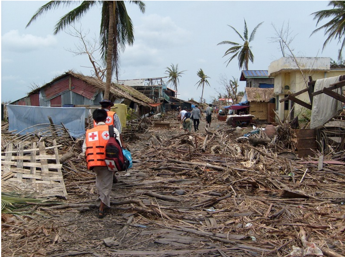
Local Red Cross volunteers walk through the debris in Bogale to conduct assessments. The magnitude of destruction and lack of accessibility to affected areas makes their task all the more challenging.

missing. The UN estimates that 2.4 million people are affected. A consequent storm surge, reportedly 3.5 metres in many areas, caused more loss of life than the cyclone itself.