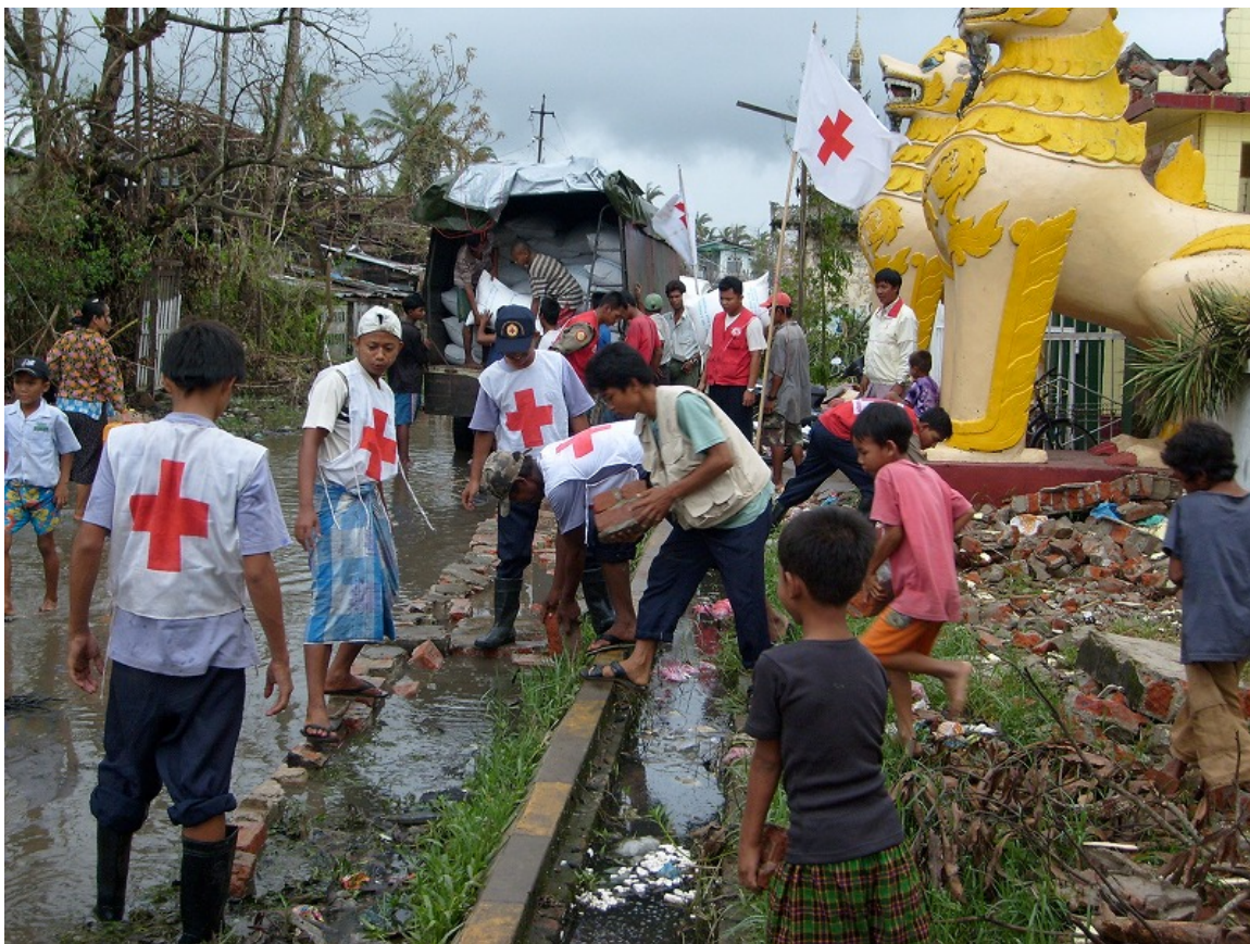
Red Cross workers distribute relief supplies and provide assistance to cyclone-affected villagers in Bogale.

The process of establishing these branches/hubs requires the identification of large numbers of staff, short term employees and volunteers. An advanced team of four members will be sent to each location to identify office space, employees, and Rubb Hall locations etc. This will be followed with basic training for staff and volunteers, and the formal establishment of a branch/hub in each location. It is intended to establish water and sanitation and hygiene promotion capacity at each hub, as well as to build capacity to ensure more thorough and focused distribution planning.