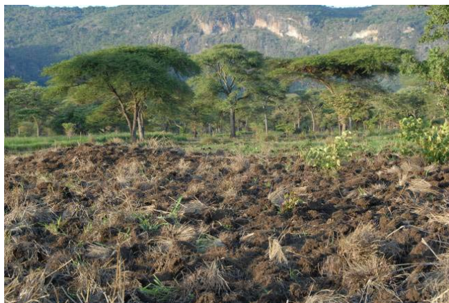
A prepared land ready for planting in Karamoja district

The proposed URCS response in the area will take into consideration the needs of the affected population, the level of assistance provided by other actors including the Government (through Ministry of Relief, Disaster Preparedness and Refugees). Considerations have been made to develop a comprehensive programme, ensuring a gender sensitive approach. The importance of securing a relief and development continuum will be regarded in the design of this operation.