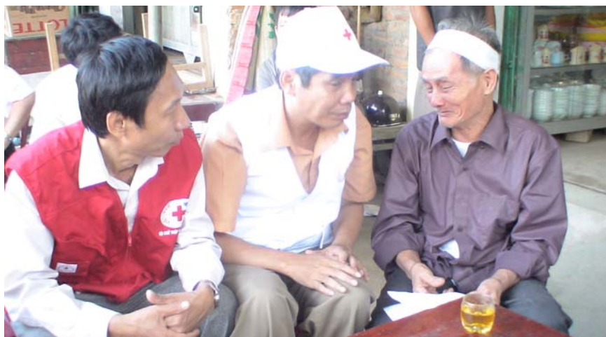
VNRC members visit households who have lost family members or sustained injuries.

The Vietnam Red Cross (VNRC) has released 1,200 household kits containing cooking utensils, a mosquito net, two blankets, a water bucket and collector. The first relief items reached the people affected in the worst-hit provinces of Phu Tho, Yen Bai and Lao Cai, two days after the disaster. Five thousands tonnes of rice were transported to the affected areas by VNRC. The national society has also provided cash of VND 550 million (USD 34,375 or EUR 23,000) from its disaster fund to support eight affected provinces.