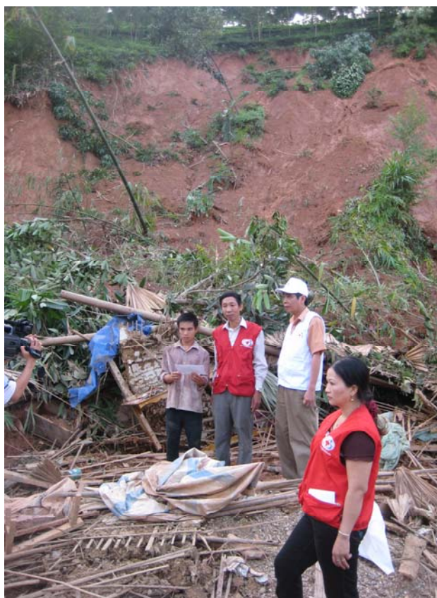
Vietnam Red Cross staff continue to assess needs and provide emergency relief to those affected.

<click here for appeal budget summary> or <here for contact details> or <here to view the map of the affected areas>