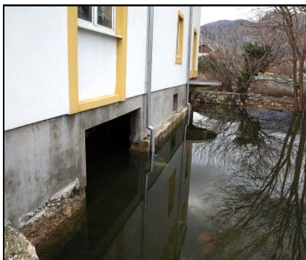
Photo 1: Flooded house in Trebinje.

This operation is expected to be implemented over one month, and will therefore be completed by 17 March, 2009; a Final Report will be made available by 17 June 2009.