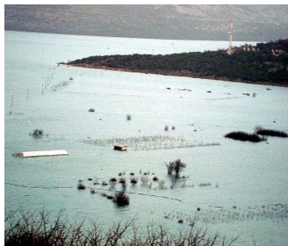
Photo 2: Flooded cultivated landscape in Ravno.