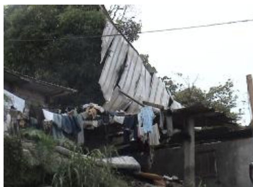
Houses destroyed by violent winds in Libreville.

Summary: During the last three months, Gabon has been exposed to violent winds followed by floods. On the night of 05 to 06 April, 2009 again strong winds have been recorded in Mouila, headquarters of the Ngounie council and in Libreville. This new event worsened the situation of the victims who had not yet found solutions to the first damages they have faced. About 100 houses were initially destroyed (52 totally and 48 partially) within five localities across the country, including the capital Libreville. The number has increased to 150 houses, 58 completely destroyed and 92 partially. As a result, many families become homeless, and roofs of schools destroyed. The number of victims has considerably increased this month as compared to March. About 481 vulnerable people (pregnant women, children under five years and elderly) were initially recorded.