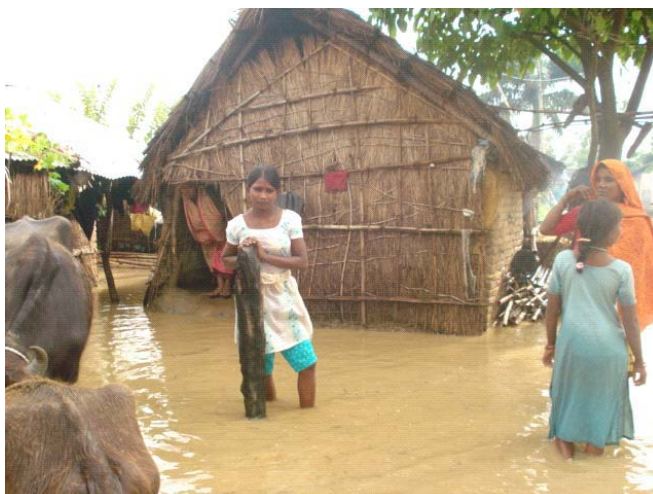
Women from a flooded village in Banke saving their belongings from the deluge.

This operation is expected to be implemented over three months, and will therefore be completed by 19 January 2010; a Final Report will be made available three months after the end of the operation (by 18 April 2010).